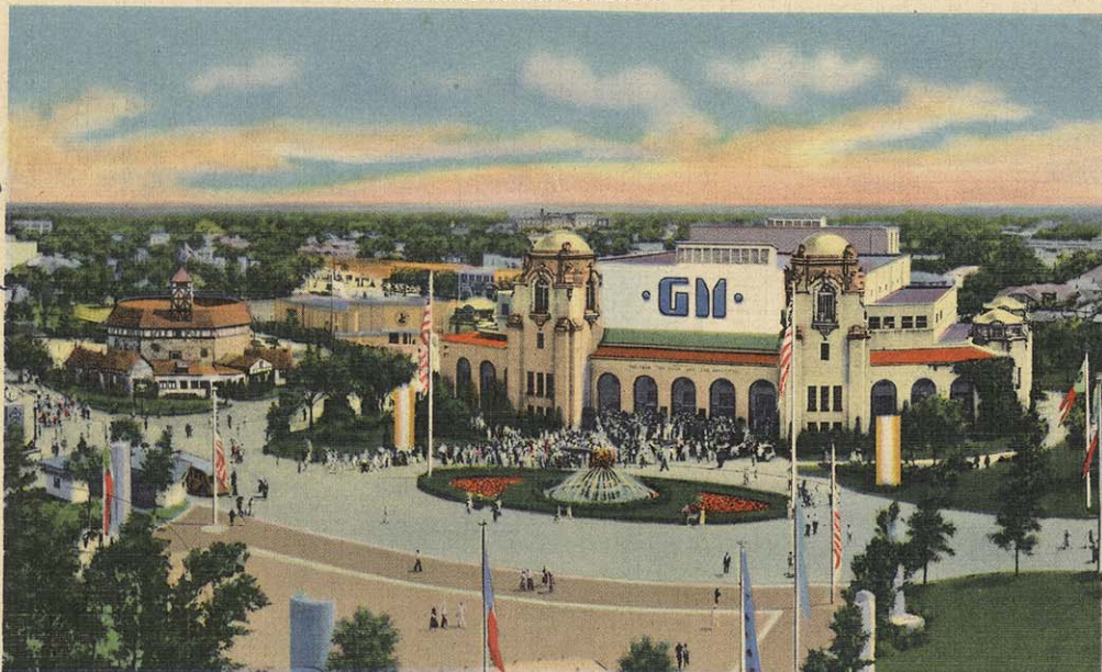
THE GENERAL MOTORS BUILDING