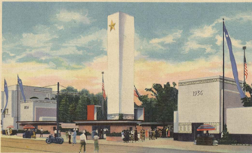
PARRY AVENUE ENTRANCE